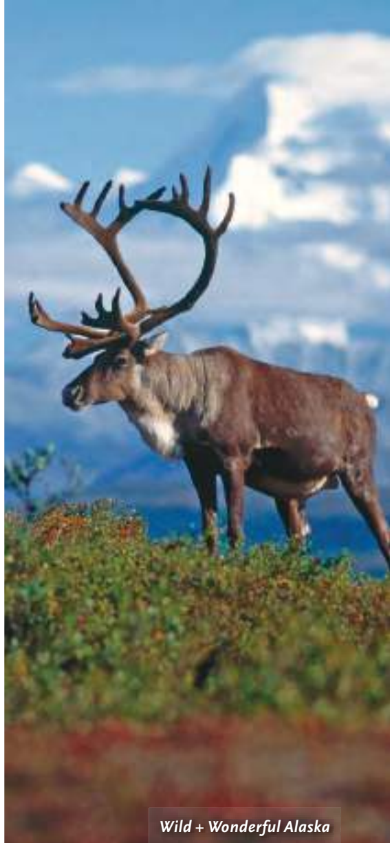
Wild + Wonderful Alaska