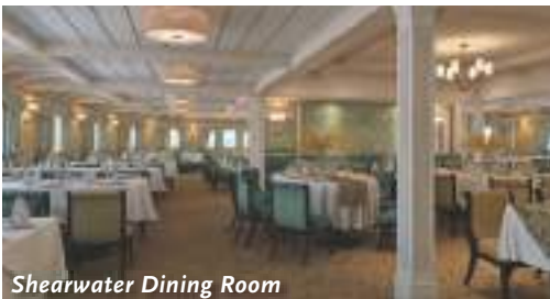
Shearwater Dining Room