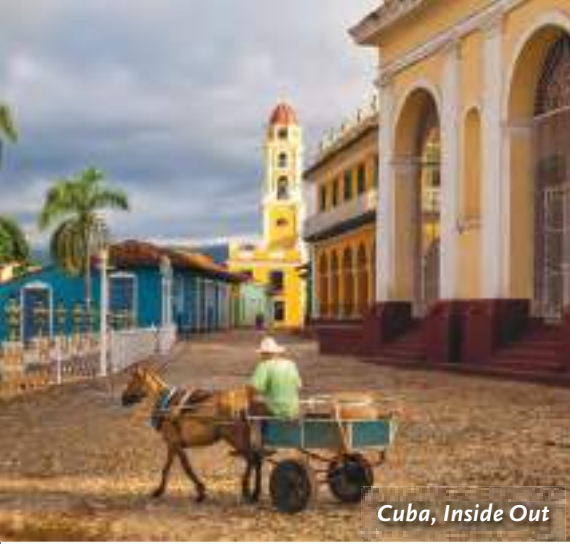
Cuba, Inside Out