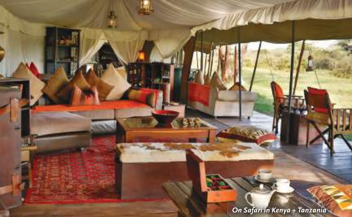
On Safari in Kenya + Tanzania