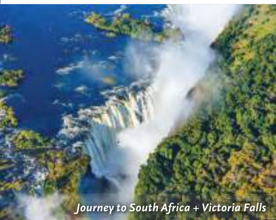
Journey to South Africa + Victoria Falls