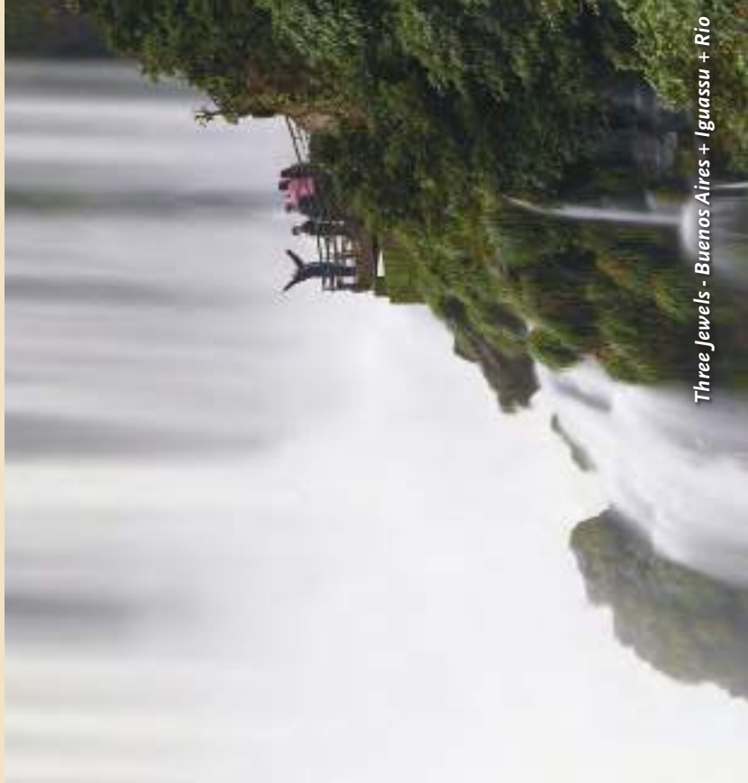
Three Jewels - Buenos Aires + Iguassu + Rio