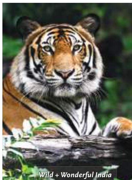
Wild + Wonderful India