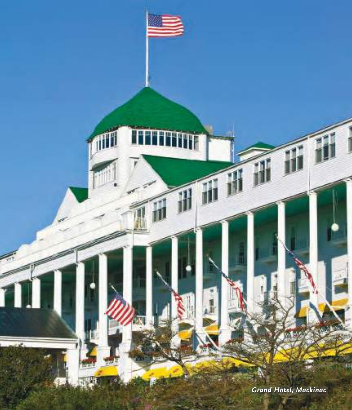
Grand Hotel, Mackinac

A FREE EXTRA DAY AND NIGHT + $1,230 SAVINGS