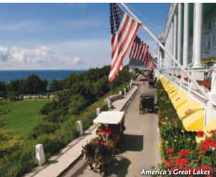
America's Great Lakes