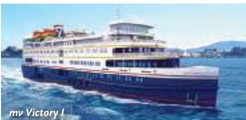
mv Victory I