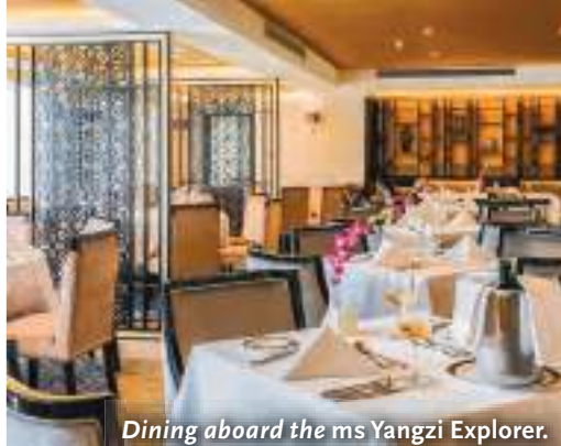
Dining aboard the ms Yangzi Explorer.